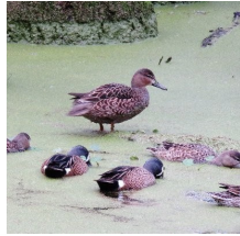
Badelying of Ducks