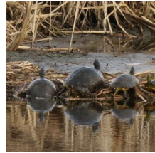
Even the yellow- bellied pond slider turtles are gathering!