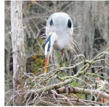
Great Blue Heron Skillfully Building Her Nest