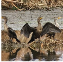
A Gulp of Cormorants