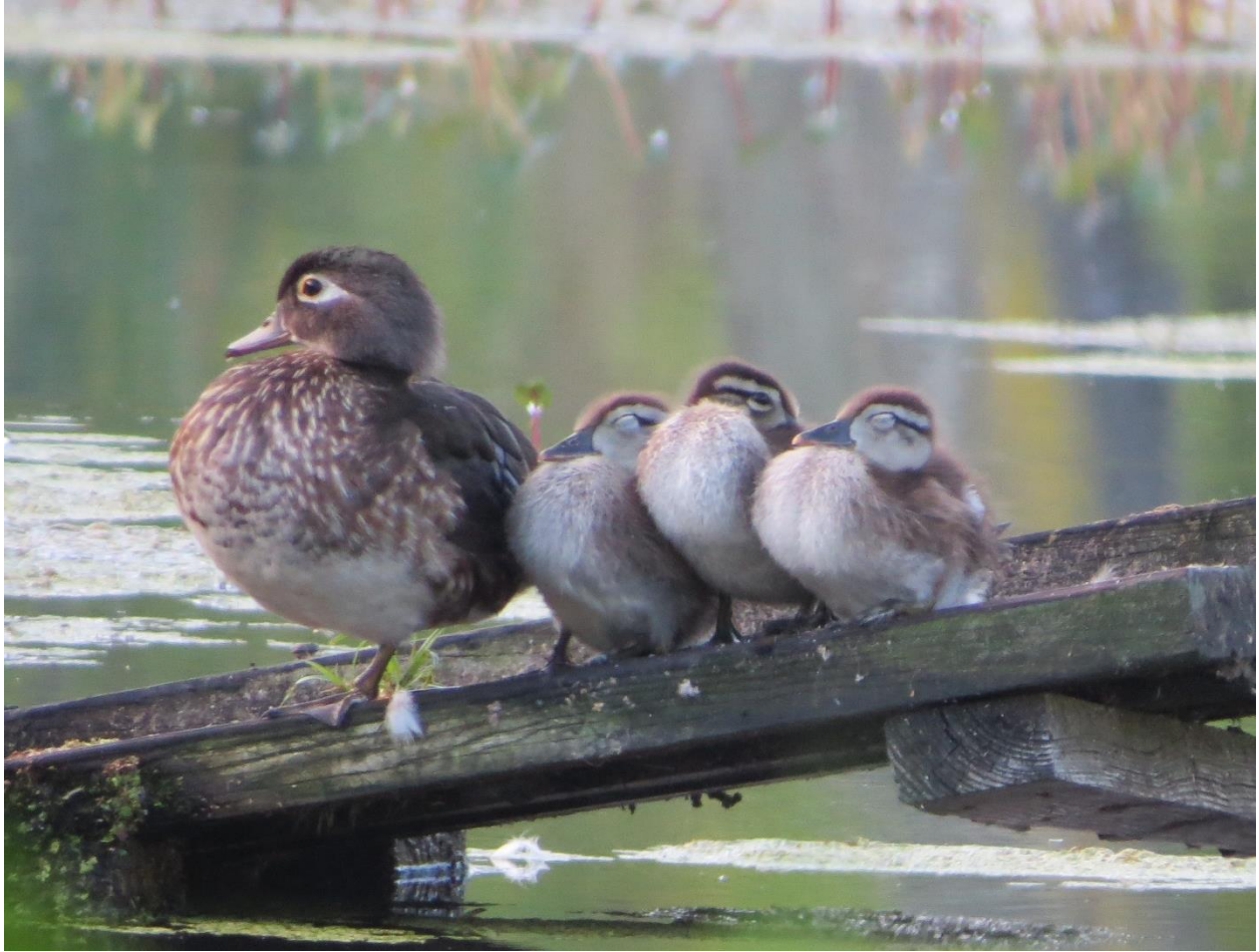
Female Wood Duck watching over her ducklings in Ravenswood

There were 20-30 for each of the Great Egret, Little Blue Heron, Anhinga, and Great Blue Heron. 43 White Ibis showed up this morning at the dike and 15 Green Heron were spotted at the dike and the Audubon Swamp. Only a few of the Least Bittern, Black-crowned Night Heron, and Snowy Egret were seen. 30 Common Moorhen and 30 Laughing Gull kept the River Trail and large old rice field from being quiet. 3 Red-shouldered Hawk went about their daily business as they swooped across the pathways. The red-bellied Woodpeckers, American Crow, Carolina Chickadee, Tufted Titmouse, the