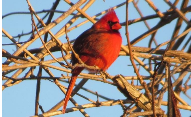
Northern Cardinal

Common Grackle and the Boat-tailed Grackle all got in double digits in numbers, but there were 30 Carolina Wren, 50 Northern Cardinal, and at least 40 Red-winged Blackbird. 3 Yellow-billed Cuckoo, a ruby-throated Hummingbird, a Pileated Woodpecker, 2 Downy woodpecker, White-eyed Vireo and a Tree Swallow were all a joy to see. Our standard