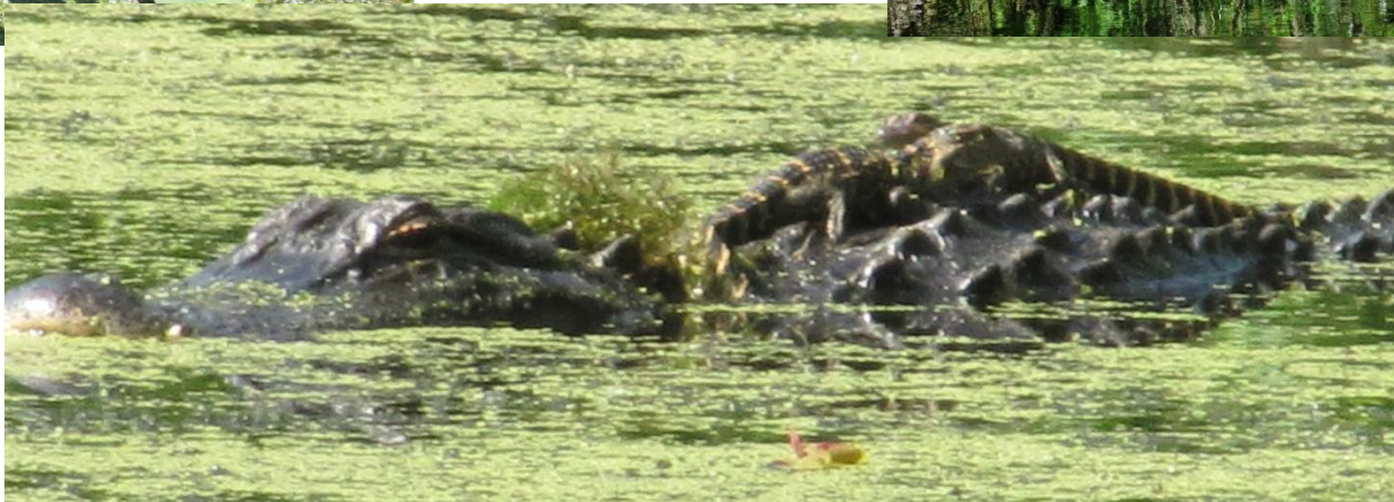
Yellow-bellied Pond Slider Turtles and Alligator carrying babies on her back